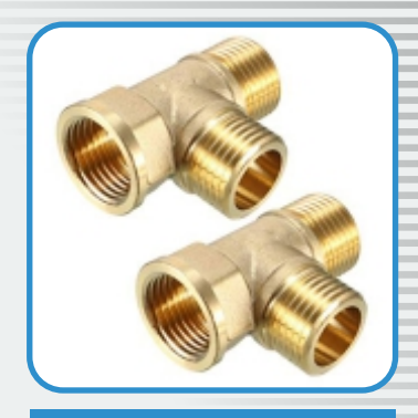
Brass Branch Tee Brass Saddle Tee