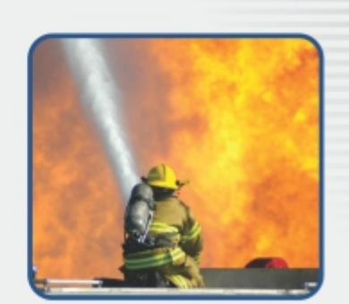
Companies, We Serve