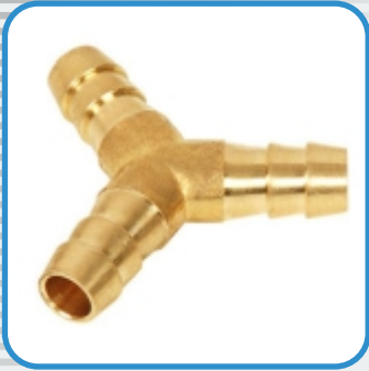
Brass Hose Y Joint