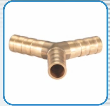
Brass Barb Y Splicer

We are manufacturer, exporter and supplier of best quality Brass Hose Y Joint. These can be purchased at budget friendly rates from us. These are also known as Brass Y Barb Joiner, Brass Y Connectors and Brass Barb Y Splicer. Specially used in piping, construction, fluid passing and other related applications, the offered nipple is also tested on certain parameters of quality. Our stock of Brass Y Connectors come under brand name "EMBROS". The offered Brass Hose Y Joints are manufactured by our skilled professionals with the use of quality assured brass.