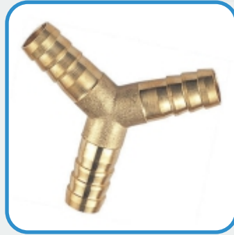
Brass Y Connector