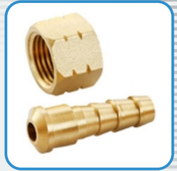
Brass Solder Fittings

We are manufacturer, exporter and supplier of best quality Brass Spray Gun Nut Nipple. These can be purchased at budget friendly rates from us. These are also known as Brass Solder Nut Nipple, Brass Hose End and Brass Solder Fittings. Our stock of Brass Spray Gun Nut Nipples come under brand name "EMBROS". The offered Brass Spraygun Nut Nipples are manufactured by our skilled professionals with the use of quality assured brass.