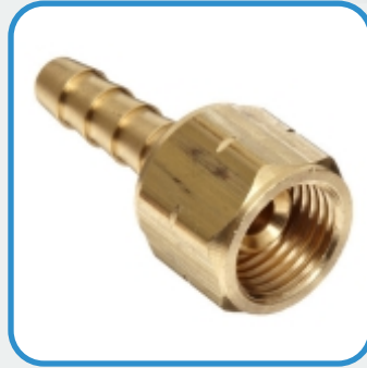
Brass Hose End