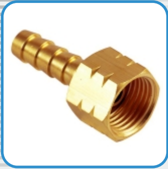
Brass Spraygun Nut Nipple