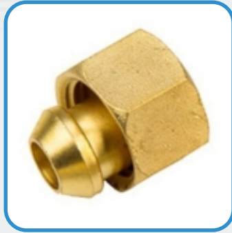
Brass Solder Nut Nipple